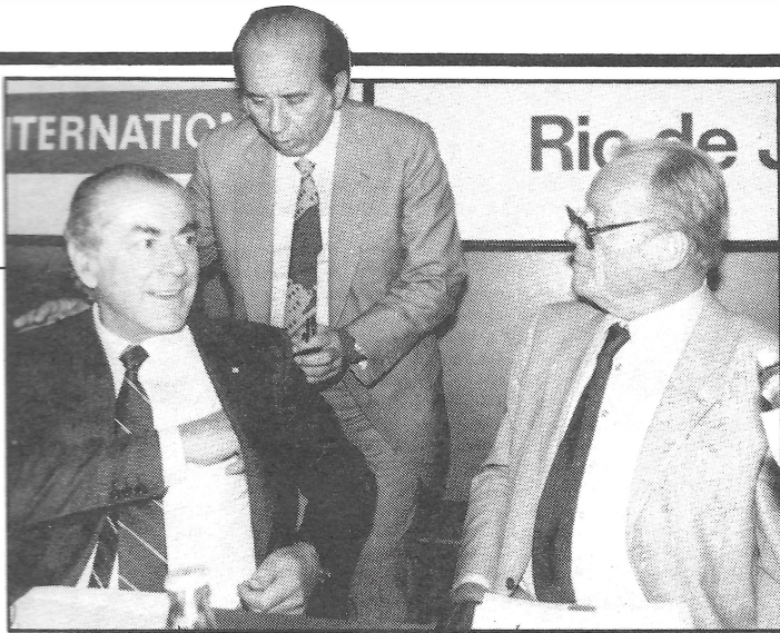
Leonel Brizola, Carlos Andrés Pérez, Willy Brandt

'Some believe in the myth that one can treat this great common crisis . . . country by country. The reality is that there is a global crisis and it threatens the future of countries and continents and the world's entire financial system'.