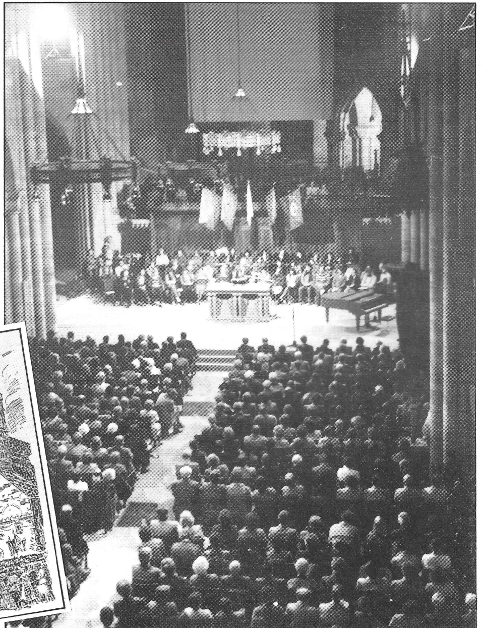
Seventy years of peace efforts: commemoration of the Peace Congress of 1912 during the 1982 Peace Week in Basle

The Bureau debated the Israeli invasion of Lebanon, the complex questions flowing from it and the initiatives which have been taken in its wake. The chairman of the Socialist International Working Group on the Middle East, Mario Soares, of the Socialist Party of Portugal, reported on the work of the group to the Bureau. He recalled the extensive activity since the invasion in June and the November meeting. The group has conducted two missions to the region and participated in the search for peace in discussion with many of the leaders in the region. Mario Soares spoke for the Bureau in his unreserved condemnation of the Palestinian massacres in September and the need to build a new momentum for peace in the