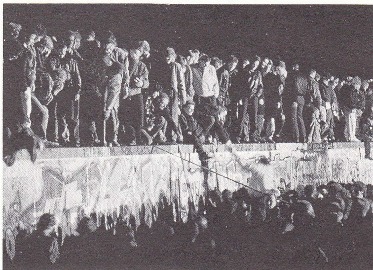
Berlin wall: fewer divisions in Europe

it is hardly likely that the dictatorship - one of the most authoritarian and ruthless regimes of today - could escape the fundamental changes occurring among its neighbour countries. We deplore this resistance to reforms and encourage all forces struggling for democratic change.